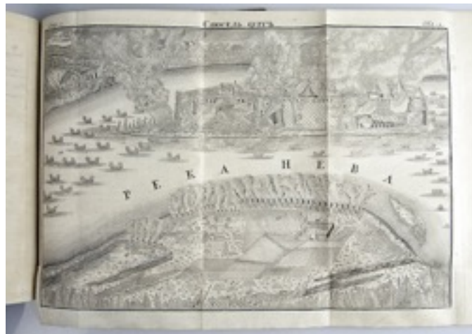
4. Lot 298: Book of Mars . Sold 34.424 €.

It is an exceptional work from the middle of the 18th century that tells stories of war between the Russians and the Swedes. The book contains 23 engravings. It is called the Book of Mars but it is also known as the War Affairs of His Majesty's Army of the Tsar taking very famous fortifications and in battles against His Majesty's Army the King of Sweden.